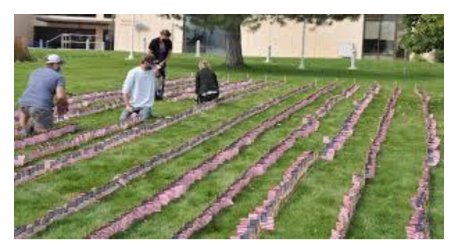
Figure 1 Flag Planting

On Friday, Sept. 11, an exhibit looking back at the event was presented on the second floor of the Cedar Building.